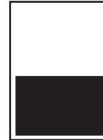
Half Page Horizontal 7 1/2 X 5