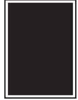
Full Page 7 1/2 X 10