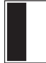
Half Page Vertical 3 5/8 X 10