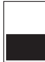
Half Page Horizontal 3 3/4 X 5